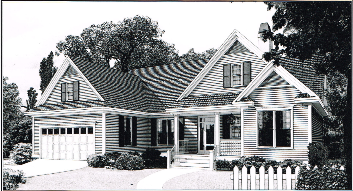
© 2000 Donald A. Gardner, Inc.

T his modest home makes the most of its square footage by utilizing a very open floor plan and volume ceilings to create a feeling of spaciousness. Columns add definition to the open dining room, while the great room enjoys a cathedral ceiling. Both the kitchen and the great room boast access to the relaxing back porch. A split bedroom design gives the master suite privacy from two secondary bedrooms.