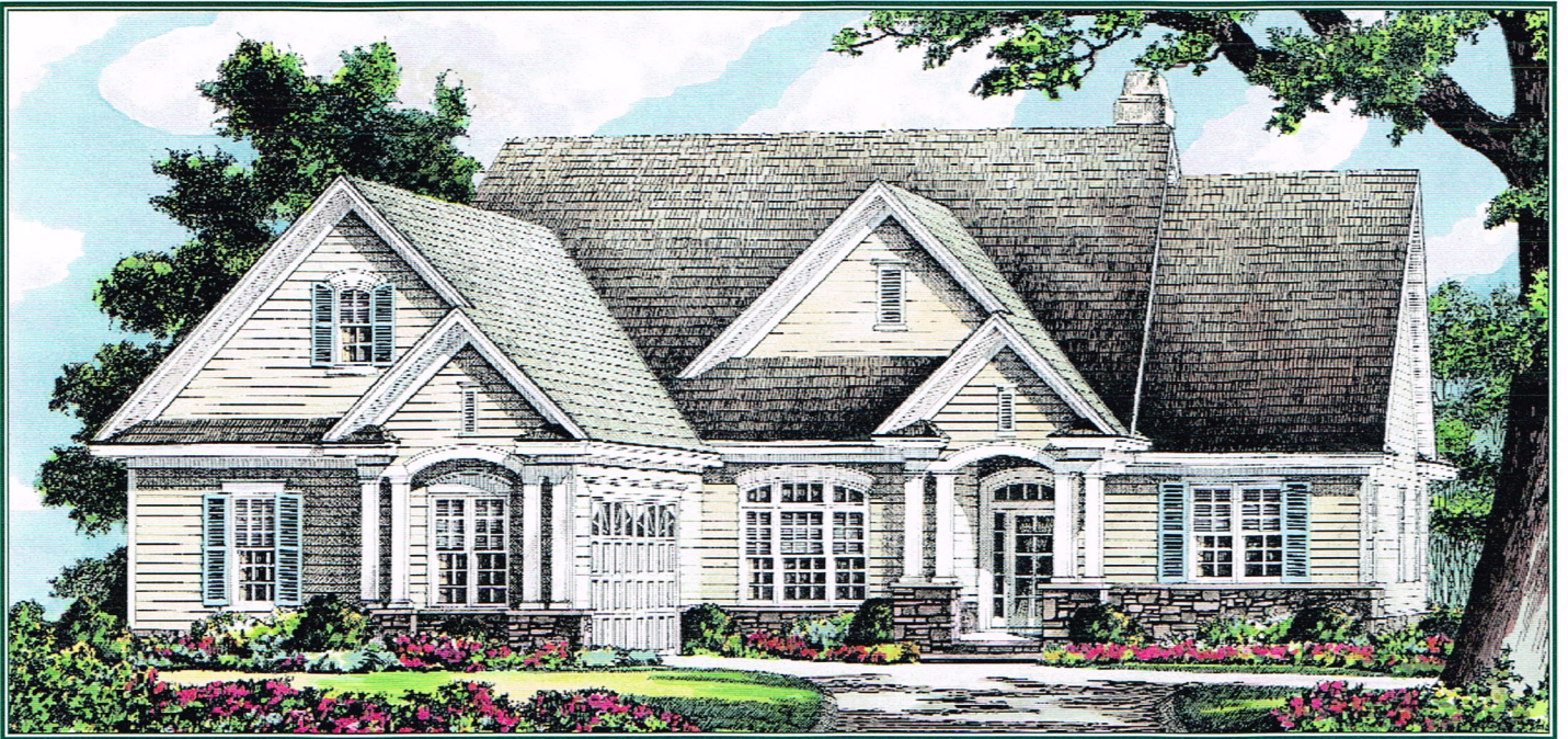
© 2004 Donald A. Gardner, Inc.